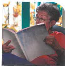
Learn new things